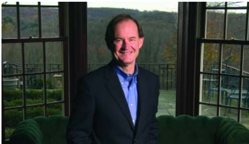
David Boies, prominent trial attorney and father of two Tulane Law School graduates, made a gift of $1.5 million to establish an academic chair at the law school.