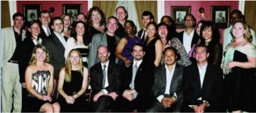
Class of 1997 Reunion