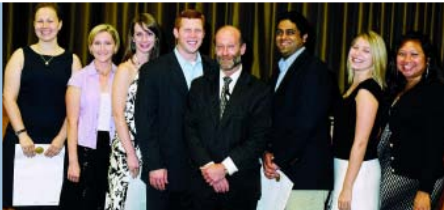
Order of the Barristers recipients at Tulane Law awards ceremony.