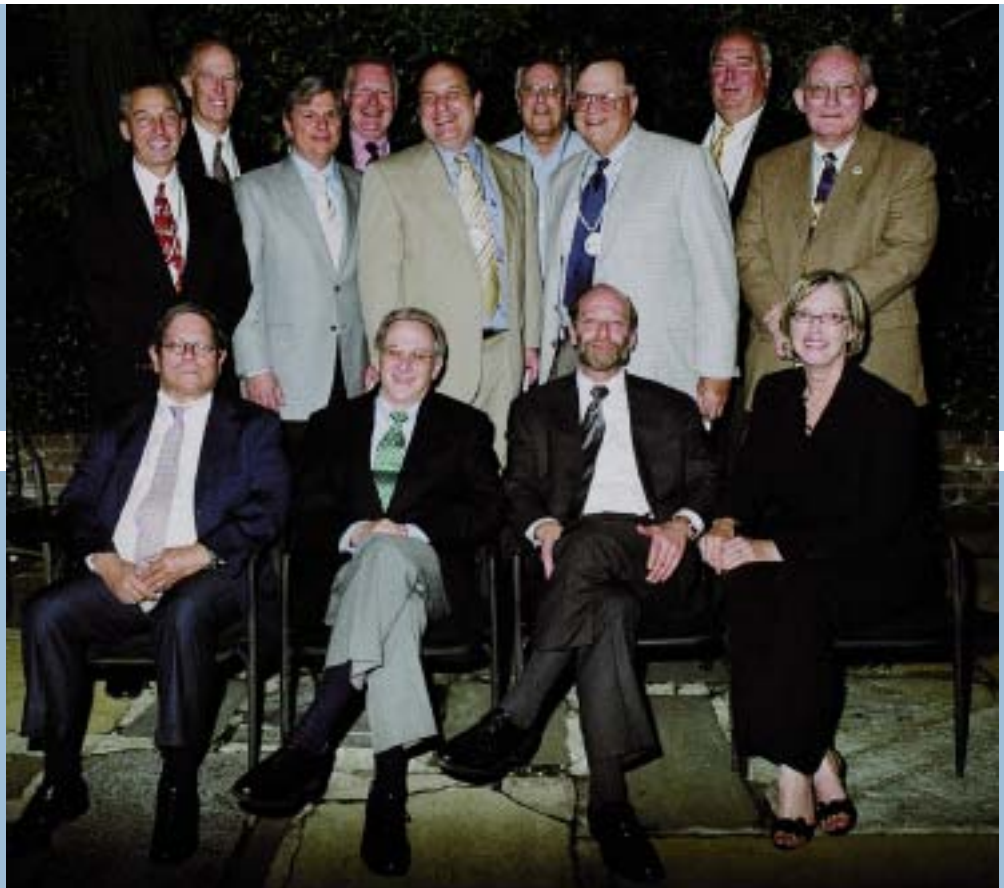
Class of 1971 Reunion