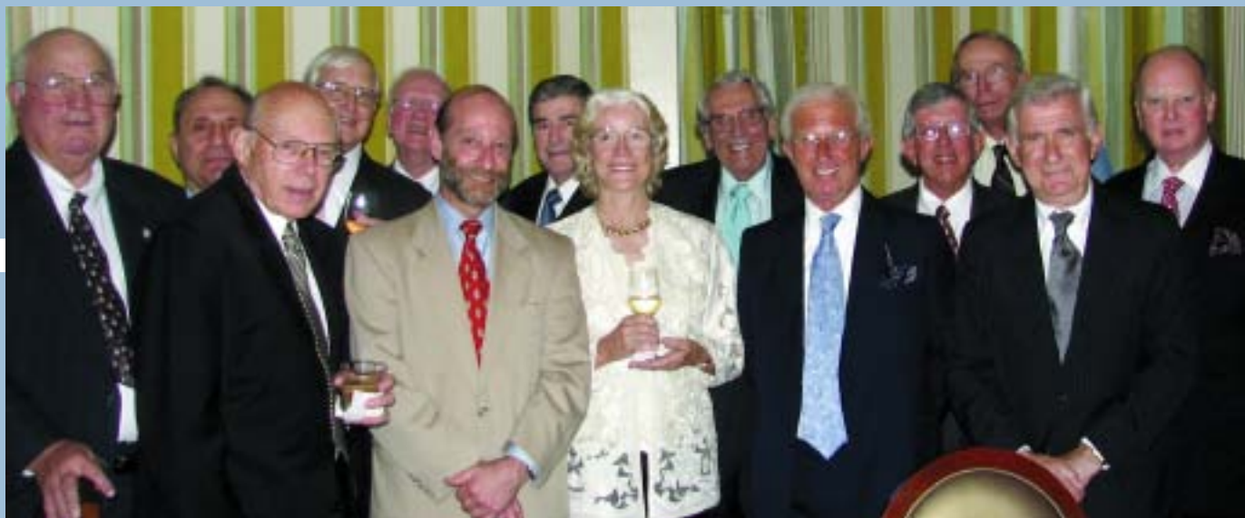
Class of 1957 Reunion, including pictures below