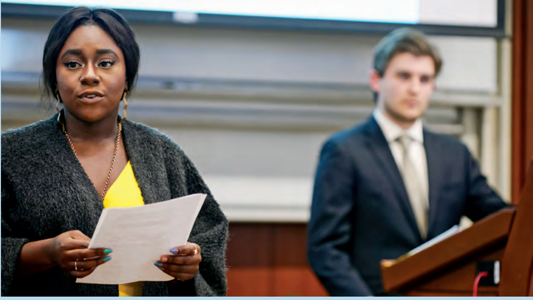
> TULANE UNIVERSITY LAW SCHOOL'S NEW BUSINESS LITERACY BOOT CAMP FOR FIRST-YEAR STUDENTS PACKED AN INTRODUCTION TO THE BUSINESS WORLD INTO AN INTENSIVE WEEK THAT WOVE EXPERT PRESENTATIONS WITH CASE STUDIES, GROUP ASSIGNMENTS AND DISCUSSIONS WITH BUSINESS EXECUTIVES.